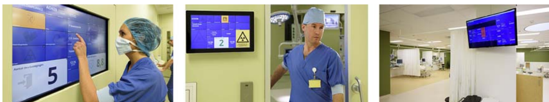
After a total of 5 months of implementation, the hospital went live with OR Cockpit+ in Dec 2015.